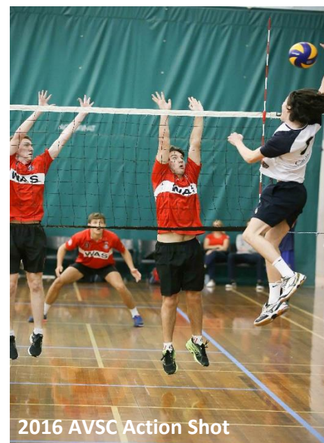
2016 AVSC Action Shot